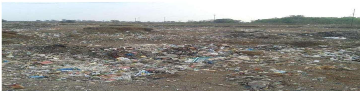
Figure 2: Waste Plastic Open Dumping

The littered plastics, a non biodegradable material, get mixed with domestic waste and make the disposal of municipal solid waste which is very difficult.