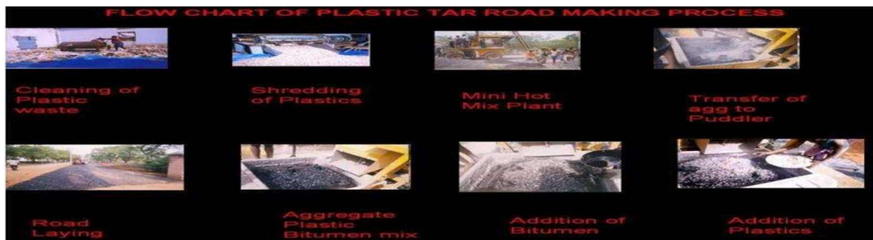
Figure 5: industrial waste Plastic Tar making process

We can see the process by looking at the figure 5: