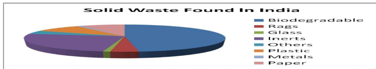
Figure 1: Pie Chart Showing Municipal Solid Waste in India

According to various Municipal Waste Management, Plastic materials comes under solid waste with their state. So by our solid waste management the solid waste dump in an open area but where it is not decomposes.