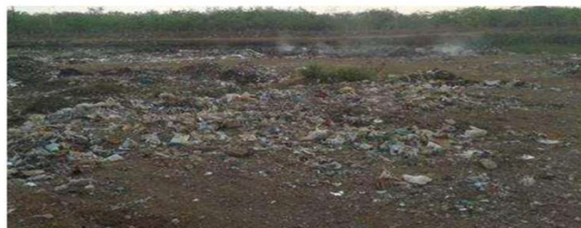
Figure 3: Plastic Burning in open dumping

Industrial Plastic waste was recycling method but it does not reduce it in large amount in India.