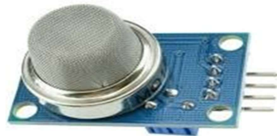
Fig. 3. MQ3 Gas Sensor

Gas sensors offer segregation along with compactness, small consumption of power, less response time, large range of operational temperature, high proficiency, in this series MQ3 is very good gas sensor having very good sensitivity to combustable gas in wide range. It is highly sensitive to natural gas .therefore MQ 3 gas sensor is used in a food spoilage detector to sense a methane and various gases. It has a long life and is cheaper in comparison to other sensor with simple drive circuitry with great portability shown in Fig. 3.