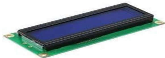
Fig. 5 LCD Display

An LCD is an electronic display module which uses liquid crystal to produce visible image shown in Fig. No. 5. The 16 X2 LCD display is a very basic module commonly used in circuit. It translates a display 16 character per line in 2 such lines. In this, LCD each character is displaced into 5x7 matrixes. The LCD display is interfaced with the ARDUINO to flash the information sent by the gas sensor regarding the quality of food. In this way the user gets the information and proper monitoring is possible for different kind of food.