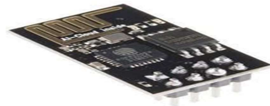
Fig. 4. Wi-Fi Modem ESP 8266

Analog sources of Wi-Fi ESP 8266 module shown in Fig. No. 4 can host number of applications and is cheap in terms of cost which can make the task of connecting the Wi-Fi easy through different commands.