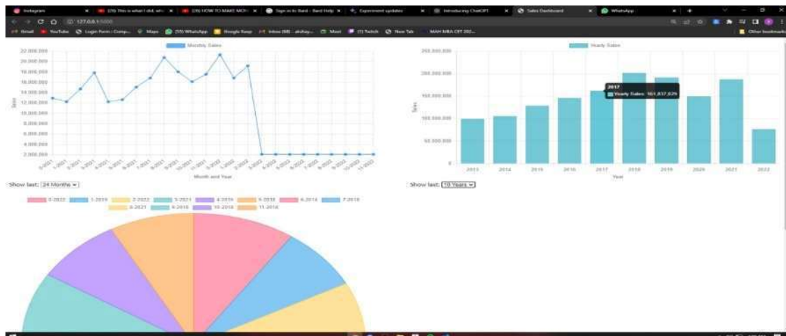
Post sales module